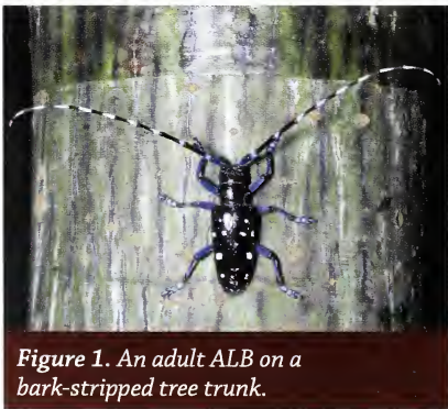
Figure 1. An adult ALB on a bark-stripped tree trunk.

The U.S. Department of Agriculture's Animal and Plant Health Inspection Service (APHIS) is responsible for taking actions to exclude, eradicate, and/or control significant plant pests such as the ALB, as authorized by the Plant Protection Act (7 United States Code 7701 et seq.).